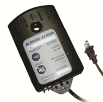
Pumping station Alarm box